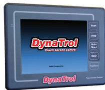
EQUIPPED WITH DYNATROL HMI TOUCH SCREEN