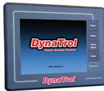
EQUIPPED WITH DYNATROL HMI TOUCH SCREEN