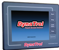
EQUIPPED WITH DYNATROL HMI TOUCH SCREEN