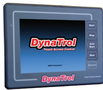
EQUIPPED WITH DYNATROL HMI TOUCH SCREEN